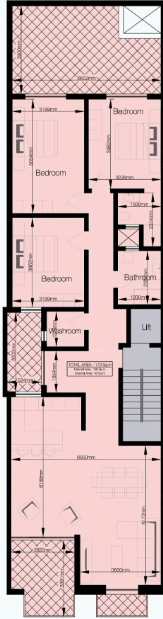
LEVEL 1 SCALE 1:100