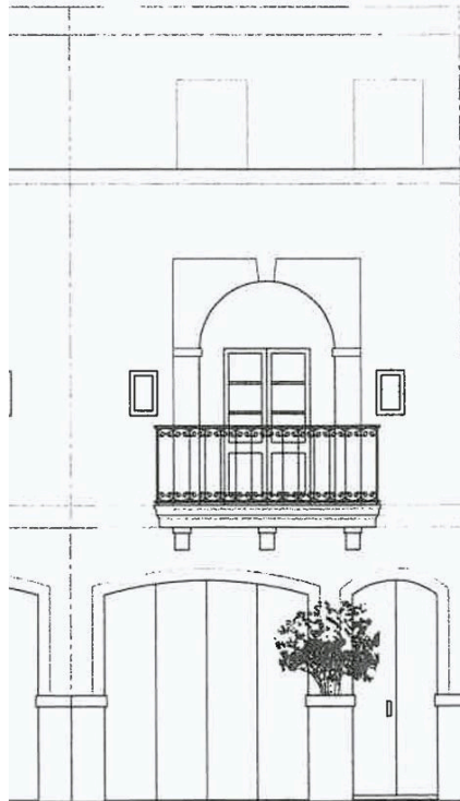
Elevation Scale 1:100